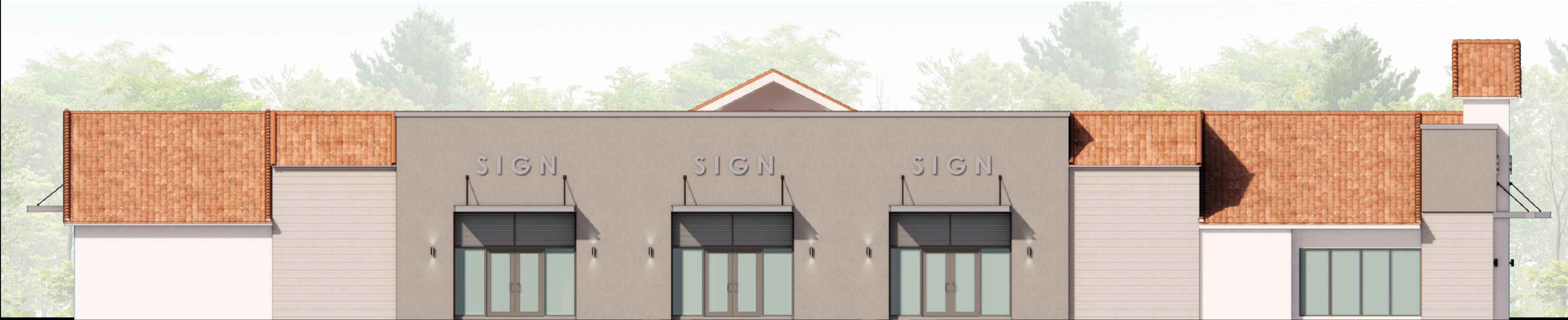
2 ADJACENT BUILDING EAST ELEVATION - REFERENCE ONLY SCALE: 1/8" = 1'-0"