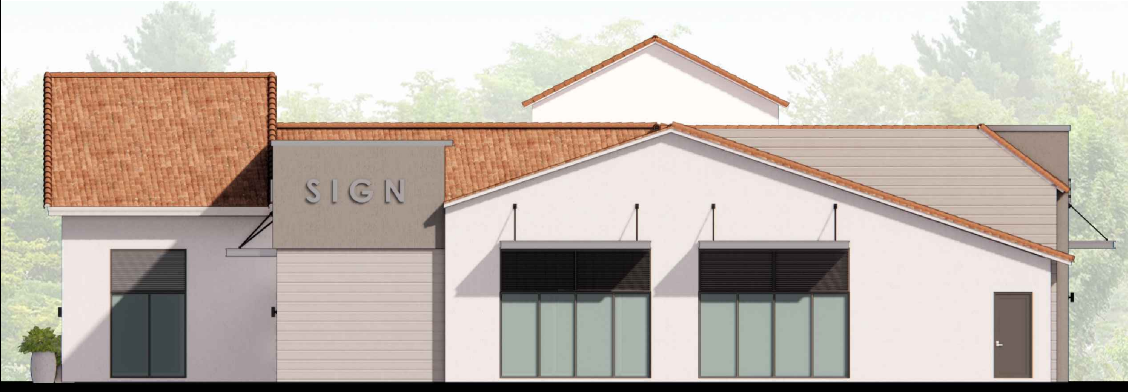
1 ADJACENT BUILDING SOUTH ELEVATION - REFERENCE ONLY SCALE: 1/8" = 1'-0"